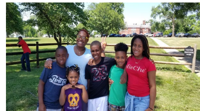
Family Day United States Penitentiary (USP) Leavenworth 2018