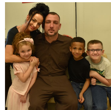
Family Day United States Penitentiary (USP) Leavenworth Prison 2019