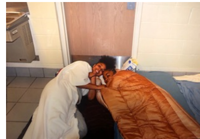
Mother-Daughter sleepover at Greenville Women's Prison 2016